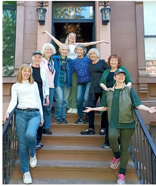
148 W. 132 nd Street