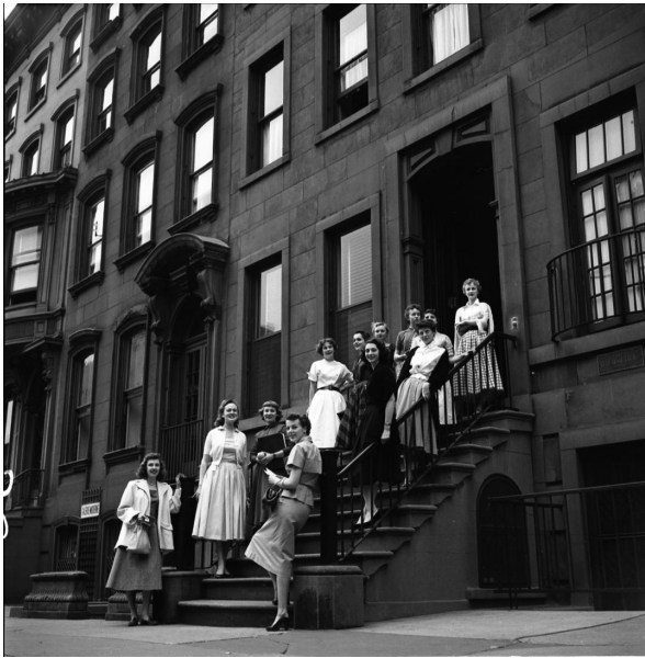
47 W. 53 rd Street